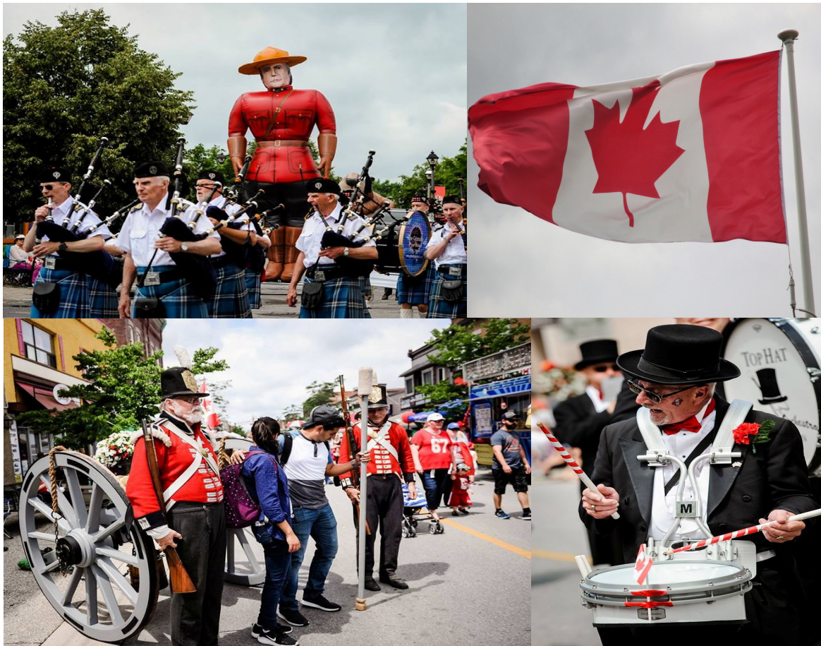
Canada Day 150 in Niagara Falls